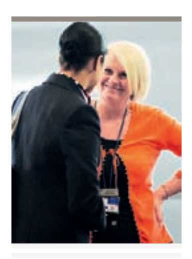
Our employees are central to our ambitions to be the world's leading global premium airline.